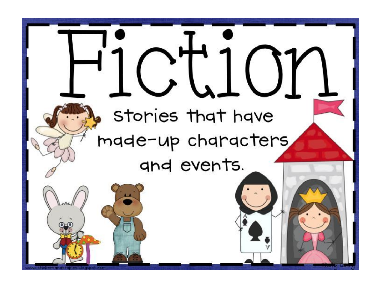
Task 2 Can you find a fiction text at home and read this to an adult.